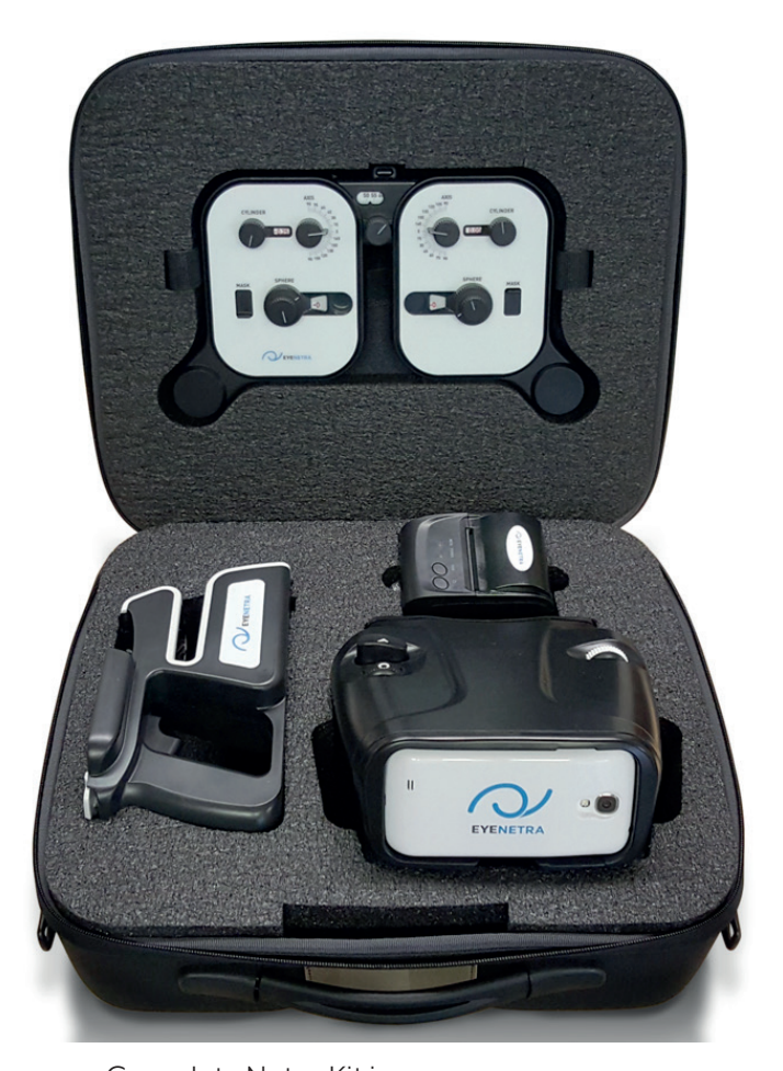
Complete Netra Kit in carry case

For pop-up clinics, vision screenings and tele-optometry, EyeNetra devices collect all the necessary information to prescribe glasses and contact lenses. Smartphone powered refraction.