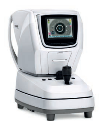
ZEISS VISUREF 500 Auto Ref-Keratometer