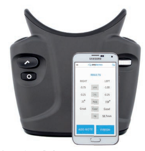
Netra Auto Refractor