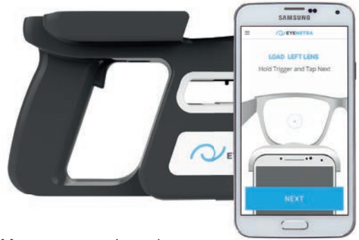
Netrometer Auto Lensmeter