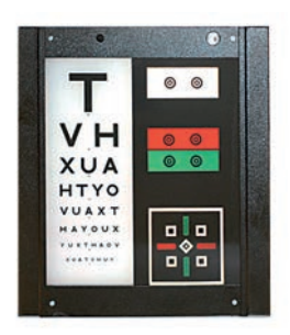
3 METRE DOM CHART