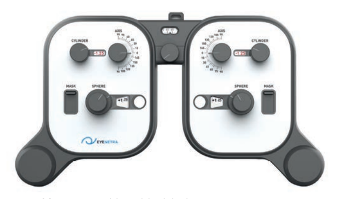
Netroptor Hand-held phoropter