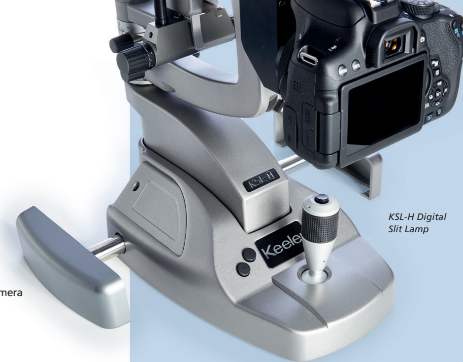
KSL-H Digital Slit Lamp

Digital Slit Lamp 3 megapixel: 2056 x 1542 USB 3 camera Kapture software