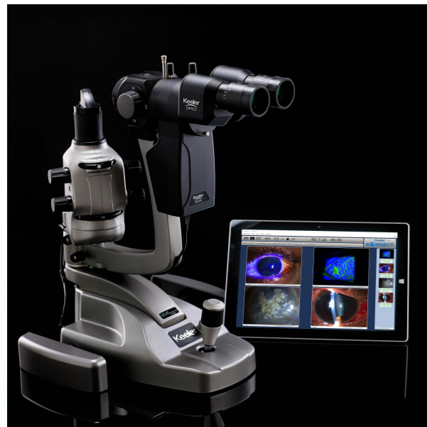
Keeler Konnect™ Software

Imaging software provides a whole new dimension to eye exams, both for you and your patients. The ability to capture images and videos enables instant exam review and the potential to offer additional services within your clinic. Efficiency and ease of use are crucial to keep up with high patient flow, therefore, Keeler has hand-picked software packages to allow users to get the most out of their Slit Lamp.