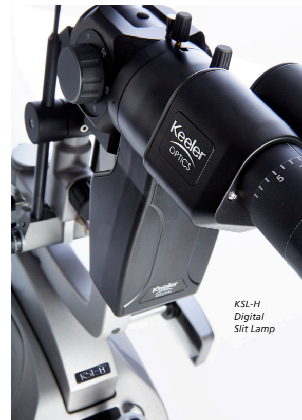
KSL-H Digital Slit Lamp

Available add-ons: digital camera, Kapture software