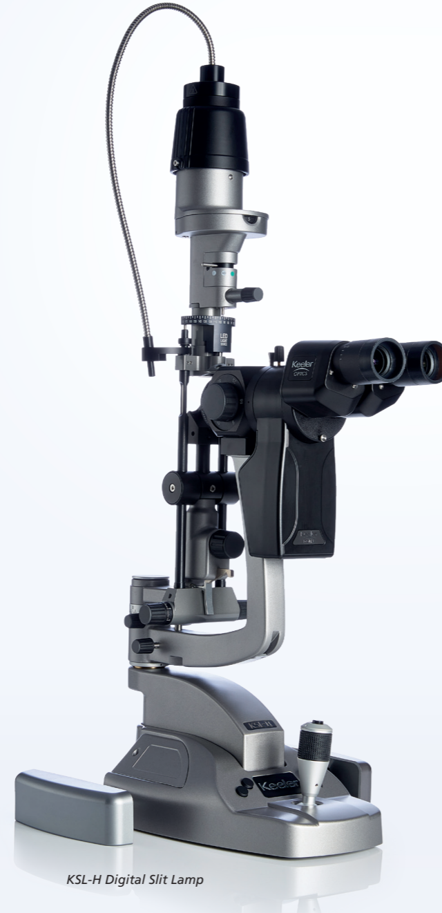
KSL-H Digital Slit Lamp