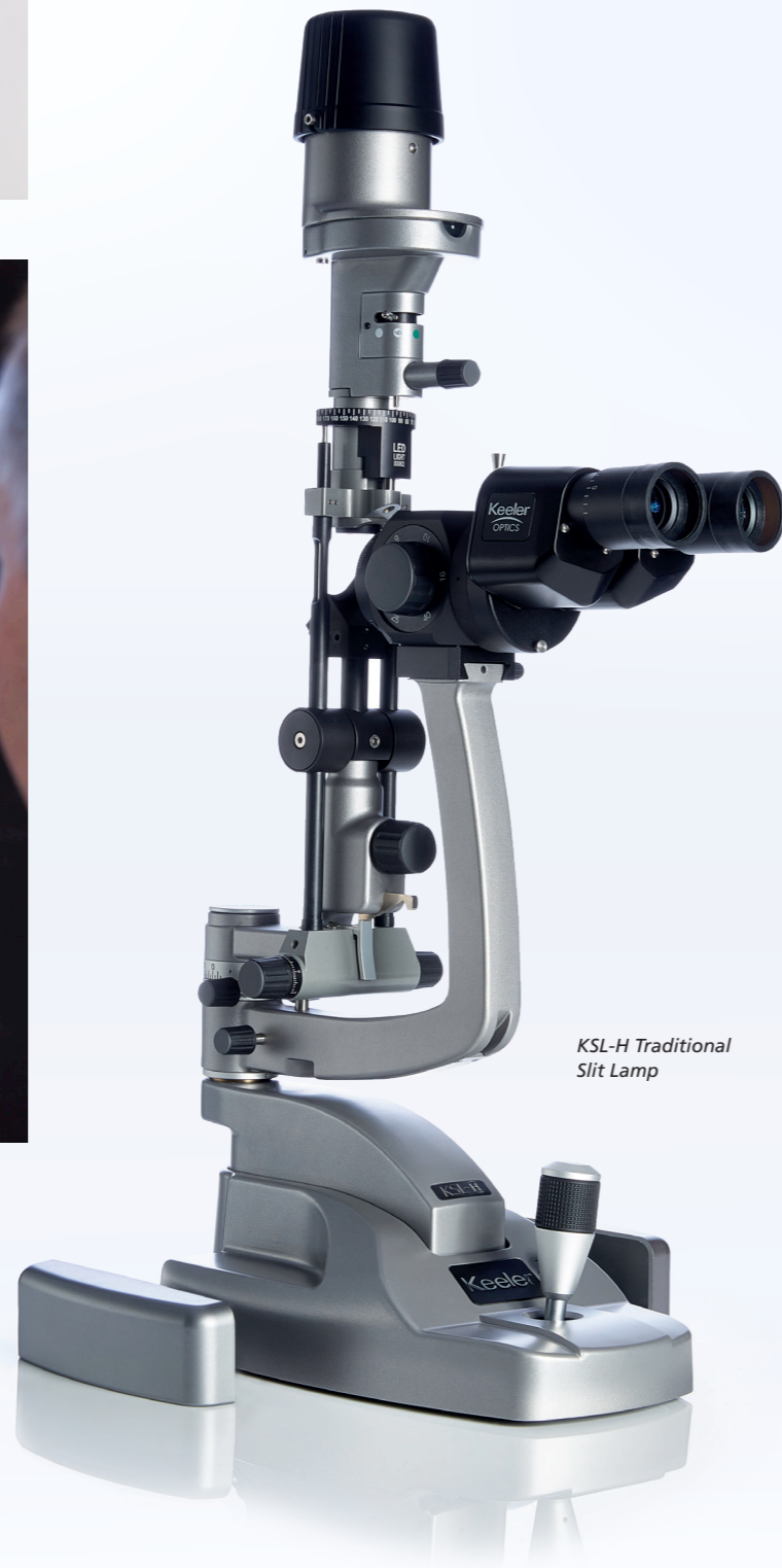
KSL-H Traditional Slit Lamp