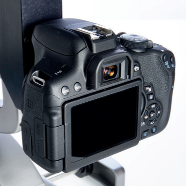
KSL-Z Digital Ready Slit Lamp with camera attachment

Lower Illumination 5 step magnification (6x, 10x, 16x, 25x, 40x) Digital Slit Lamp 3 megapixel: 2056 x 1542 USB 3 camera Kapture software