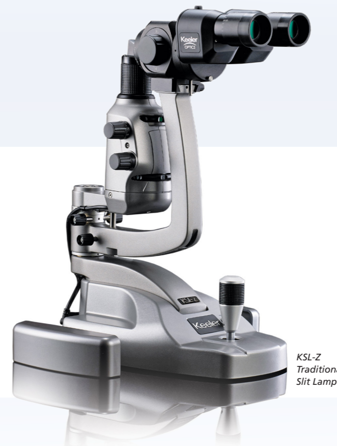
KSL-Z Traditional Slit Lamp

Available in Traditional, Digital and Digital Ready and with a 3 or 5 step magnification.