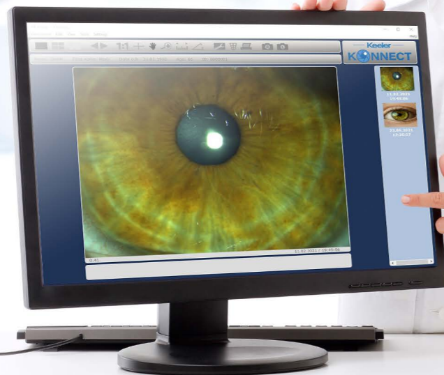
Keeler Konnect™ Software