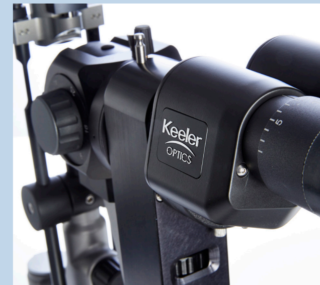
World Class Keeler Optics

Available in Traditional, Digital and Digital Ready and with a 3 or 5 step magnification.