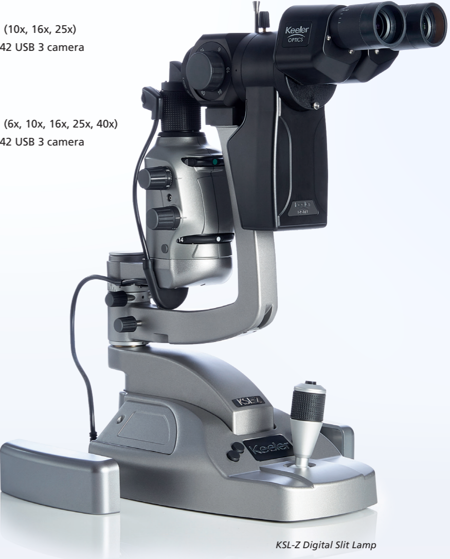
KSL-Z Digital Slit Lamp