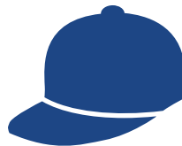
Wear a Hat